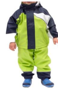
Waterproof Coat & Trousers